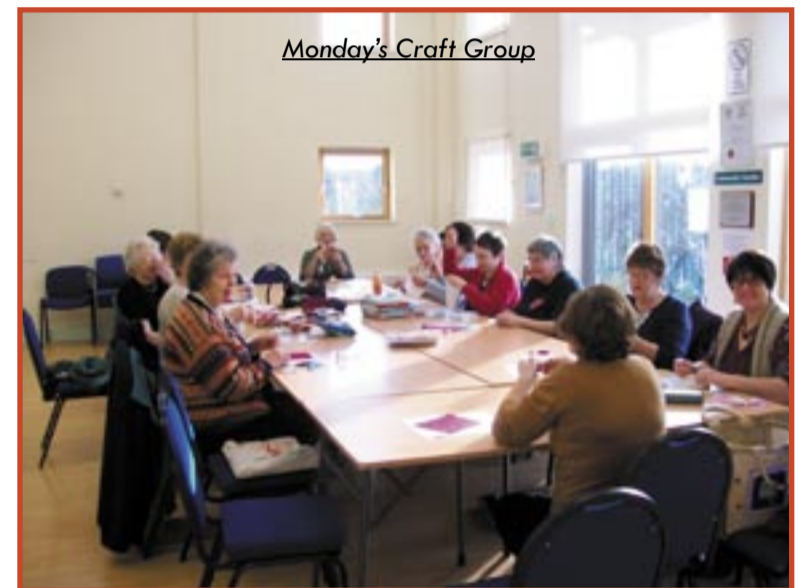
Monday's Craft Group

Youth activities take place at Springbank Community Resource Centre Youth Centre on Tuesdays from 4:30 to 6:30pm for 8 to 11 year olds and on Thursday evenings from 6:30 to 7:45pm for 11 to 14 year olds and 7:45 for 14 to 19 year olds.